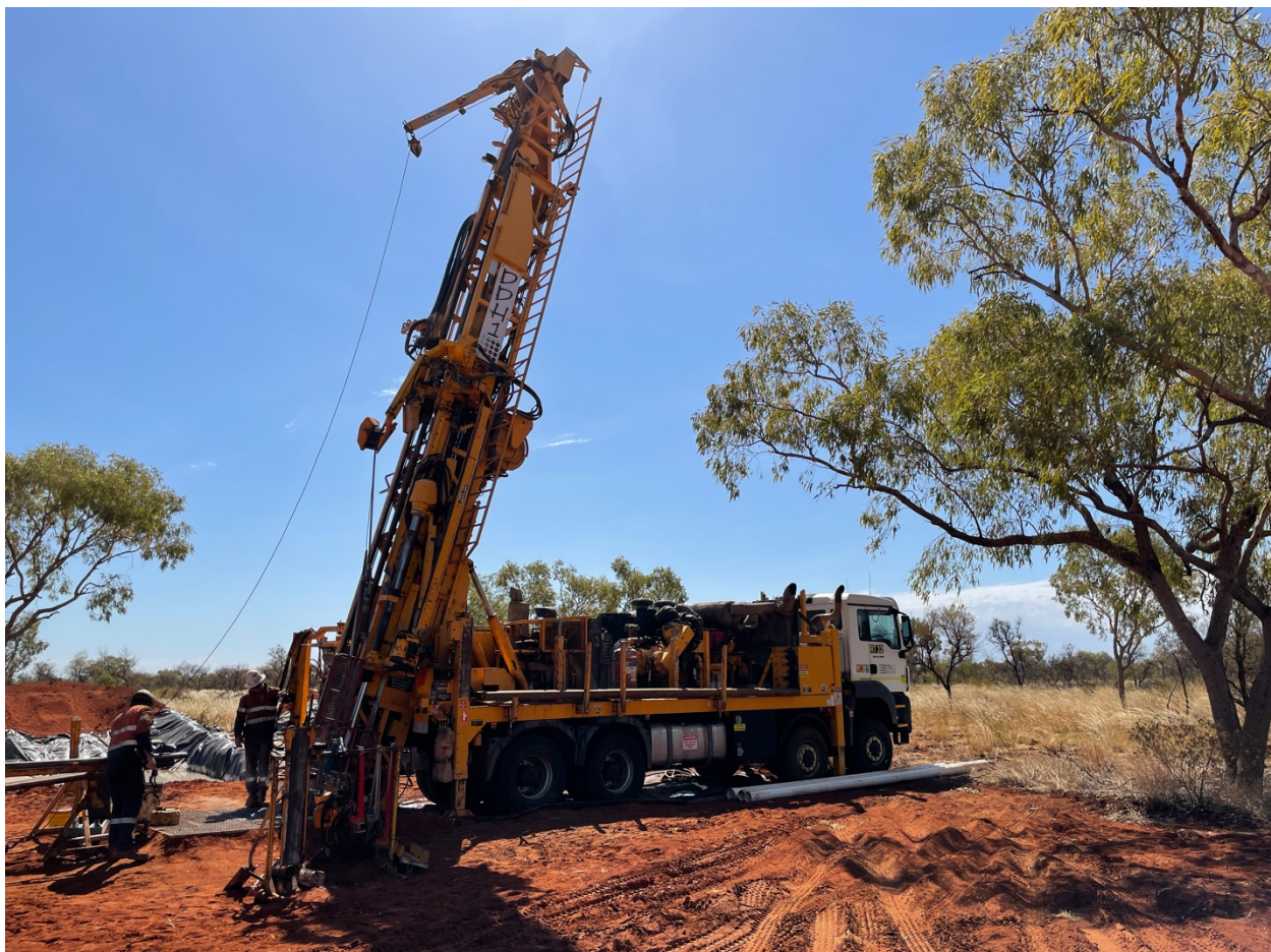
Figure 1: Drilling underway at the Cottage copper-gold target

SER will be drilling two inclined diamond drill holes. Drilling of hole BKDD001 has commenced and is designed to test the source of the pipe like feature evidenced in the gravity modelling, while the second hole is designed to test through the gravity feature and into the magnetic anomaly at depth. Drilling of both holes is expected to be completed early October with lab assays to follow. This drilling program was awarded co-funding from the Northern Territory Government under the Resourcing the Territory initiative. 1